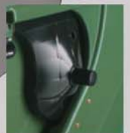
D6208 & 12 only

Perkins Manufacturing Company 737 Oakridge Drive Romeoville, IL 60446 (708) 482-9500 Fax: (708) 354-5878 Email: tuckaway@perkinsmfg.com www.Perkinsmfg.com TOLL FREE 800-882-5292