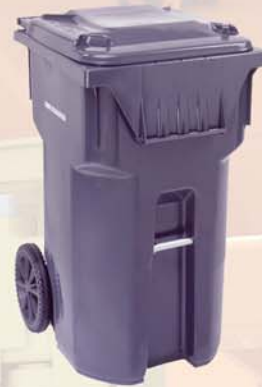
D6207 & 08 only