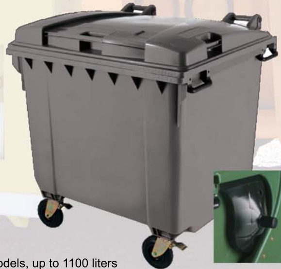
All models, up to 1100 liters