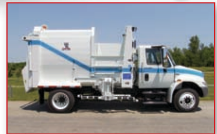
10 yd 3 AutoCat with satellite tailgate