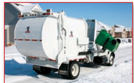
14 yd 3 AutoCat with rounded tailgate