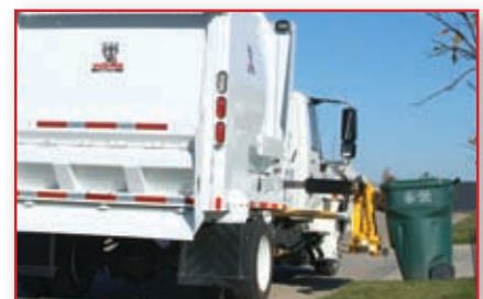
Reaches 6 ft. with a fast arm