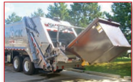
Arlock — the automated container handling option for safer, more productive commercial collections