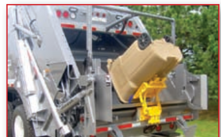
Arlock shown with optional cart tipper

WAYNE® ENGINEERED FOR PERFORMANCE www.WayneUSA.com