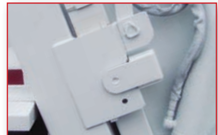
Automatic tailgate locking mechanism