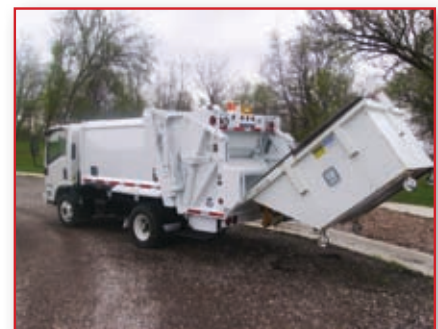
Handles commercial containers up to 6 cu. yds.

WAYNE® ENGINEERED FOR PERFORMANCE www.WayneUSA.com