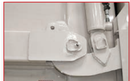
Automatic cam-over-latch tailgate locking mechanism activated from cab