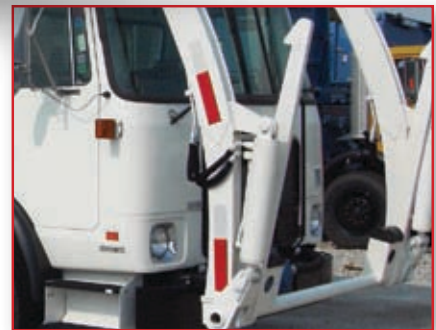
Front forks load rated for 8,000 lbs.